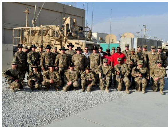
G2, FIRST CAVALRY DIVISION

Keep those donations coming in SARW members! Your time and effort do make a difference in the lives of our military troops. Thanks for caring!