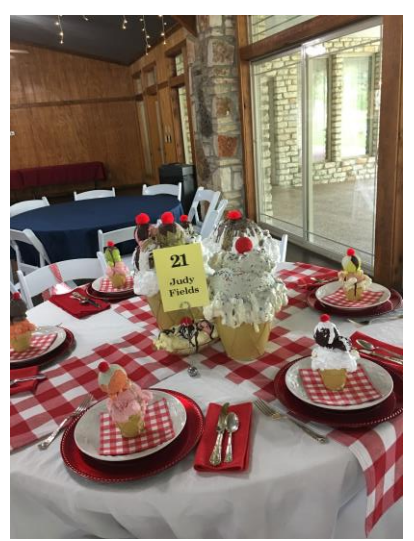
Judy Fields – Individual FCL Winner