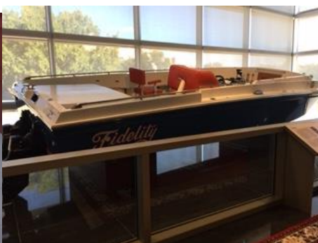
President's boat at Kennebunkport, Maine