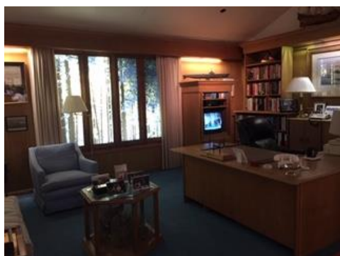
Bush's Camp David Office

Pictures from our visit to President George H.W. Bush's Presidential Library: