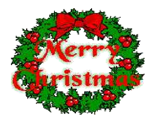
TO ALL SARW MEMBERS AND THEIR FAMILIES

January 3 – Pints and Politics, Deadfish Grill – 6:00 p.m.